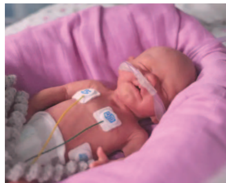
NeoFlow nasal cannula.

Should there be a need for escalation, NeoFlow transition kits allow a seamless transition to nCPAP. These can be used longer term if the infant must remain on nCPAP, or are a cost-effective alternative for a situation where nCPAP is required for a short period until the patient improves.