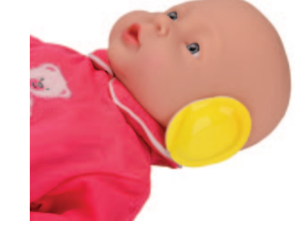
Sonic Ear Muffs from Walters Medical.

a decrease in respiratory rate and pulse. With at least 7db reduction in sound and 360-degree protection, Sonic ear Muffs are MRI safe.