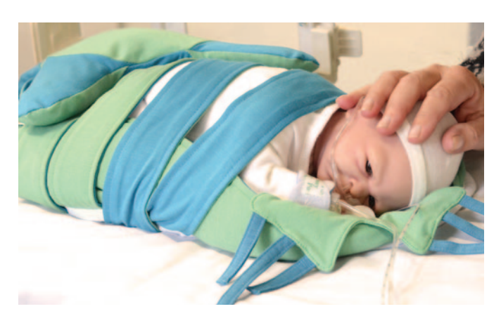
The Benjamin care range from Delta Medical.

TurtleTub swaddle bathing blankets and bath tubs, which promote a calm and relaxed environment for babies to enjoy a