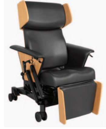
The VELA Neonatal Chair from Walters Medical.

easily change their position while sitting by adjusting the multi-position settings. The chair can be raised to the desired height using the electric height adjustment, allowing parents to sit or rest at a suitable height to reach their child in the incubator. Users can sit up by themselves and get up from the chair while holding their baby, without having to call staff or put down their child; the central brake ensures that the chair is stable.