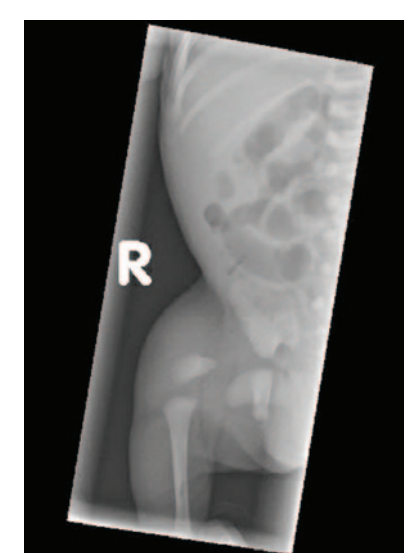
FIGURE 2 The radiographic appearance of the limbs showing marked skeletal abnormalities.

confirmed on a skeletal survey as underdevelopment of the long bones in the upper and lower limbs, indicative of congenital quadrilateral phocomelia. Both humeri were intact with neither progressing to structures of the forearm or hand.