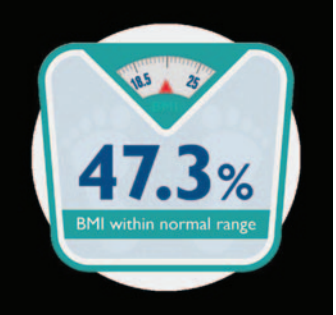
FIGURE 1 52.5% of women giving birth in 2015/16 were aged over 30 years and just 47% had a BMI within the normal range. These findings have implications for clinical outcomes and service provision.

skin-to-skin contact and breastfeeding. A five-minute Apgar score of <7 has been associated with an increased risk of cerebral palsy, epilepsy, developmental delay and infant mortality. Results suggest that 1.2% of singleton babies born at term in Britain have an Apgar score of <7 at five minutes of age. However, this proportion varies from 0.3% to 3.5% between maternity services despite adjustment for case mix (FIGURE 2).1