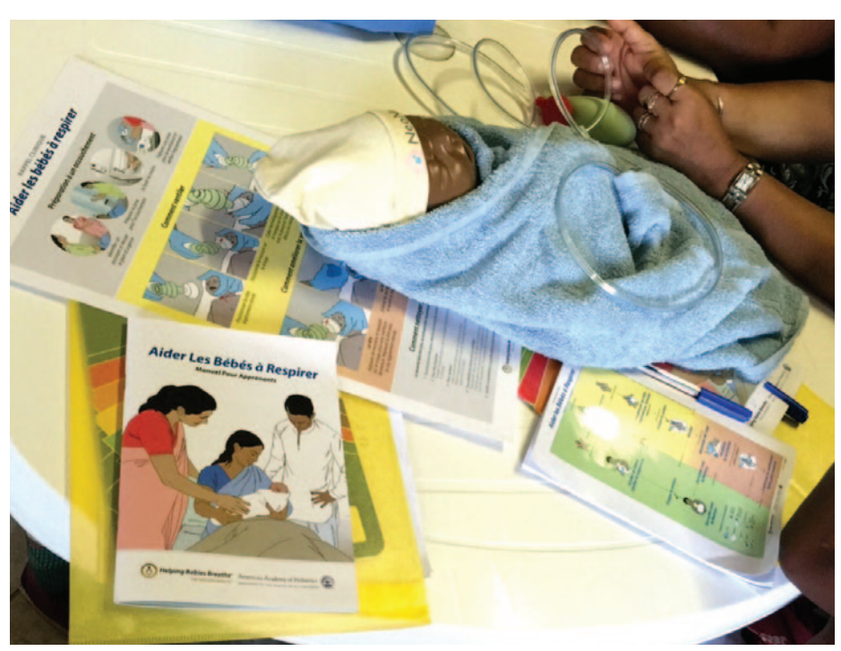
FIGURE 2 The NeoNatalie manikin and HBB training materials (in French).

Madagascar is renowned for its rich biological diversity and endemic wildlife. Despite international interest in conservation and wildlife tourism, Madagascar remains one of the world's poorest countries ranking 158/188 in the Human Development Index. The population is largely rural, with only 35% living in urban areas. The health service in Madagascar is supported by both the public and private sectors; however communication infrastructure is poor, making delivery of even basic health care difficult. Overall service strategy is coordinated at national level through the Ministry of Health.9 International nongovernmental organisations such as Unicef and USAID provide technical and financial assistance to contribute to health system strengthening.