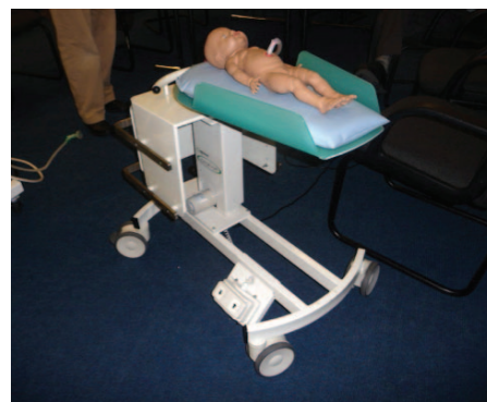
FIGURE 5 The first Inditherm prototype trolley.

rotation of the resuscitation platform was achieved through rotation of the whole equipment. Ancillary equipment for ventilation etc, was incorporated onto medical rail systems, which allowed equipment to be customised to each hospital’s requirements. The new trolley was again tested in a number of scenarios and proved to meet clinical requirements. With an agreement to use the trolley in the UK preterm birth study 13 , Inditherm completed CE marking of the equipment and donated a trolley to Liverpool Women’s Hospital. The trolley was marketed under the name of LifeStart in April 2012 ( FIGURE 6 ).