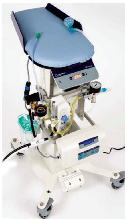
FIGURE 6 The final production model – the LifeStart trolley.

The heart rate is generally considered the most important parameter of health in the newborn infant and there is no reason why the method used during labour cannot be continued postpartum. The commonest method is using Doppler ultrasound with computer analysis to extract the heart rate. Once the infant is born, a specially designed and much smaller and lighter