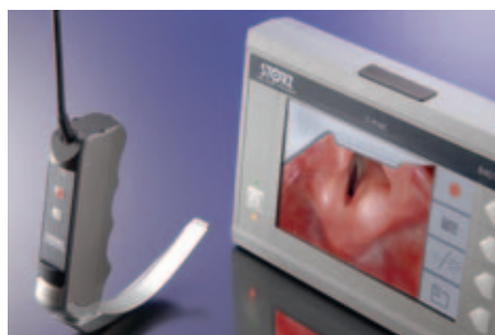
FIGURE 2 The Storz DCI video laryngoscope.

Where direct laryngoscopy has failed, the assistance of the most experienced neonatologist should be sought. A neonatologist or anaesthetist experienced in the use of videolaryngoscopy may make