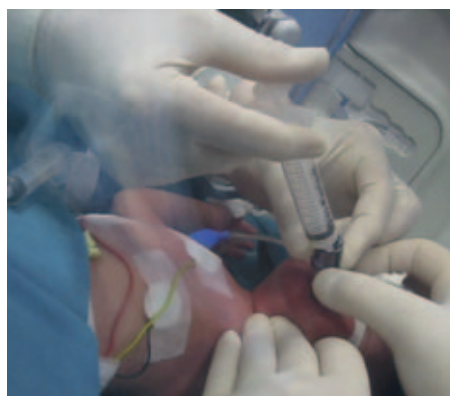
FIGURE 3 Endotracheal administration of SF through the laryngeal mask.

In 2005 Trevisanuto et al published a paper 7 in which they showed that LMA administration of poractant- \alpha at 200mg/kg, in eight babies with grade II-III RDS, was able to significantly increase the arterial/alveolar oxygen tension ( a/APO_2 ) ratio ( p<0.01 ) and significantly reduce the fraction of inspired oxygen ( FiO_2 ) ( p<0.01 ) three hours after SF administration ( FIGURE 2 ). Babies had a range of bodyweights from 880g-2520g and gestational age from 28-35 weeks. All infants were on nCPAP before administration of SF at a mean age of 28 hours (range 2-68 hours) of life.