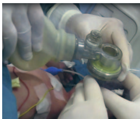
FIGURE 4 Subsequent manual bag ventilation.