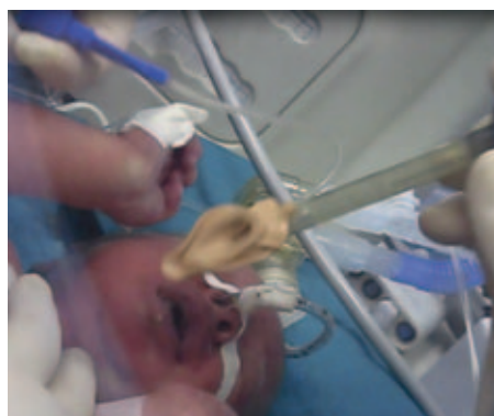
FIGURE 5 Removal of the laryngeal mask after its deflation at the end of the procedure. Note the baby was always on nasal CPAP.