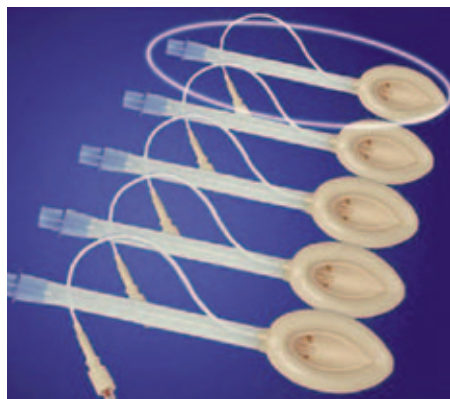
FIGURE 1 The classic laryngeal mask (LMA) in its various sizes. Within the circle the size # 1 that fits neonates 1500-5000g.

just in front of the larynx, and the oesophagus is sealed by the anterior part of the mask. A closed cavity is therefore created within the mouth by the lateral borders of the mask, the oro-pharynx and the posterior part of the tongue. In such a way air pumped into the tube from outside can easily reach the trachea without endotracheal intubation and at the same time exhalation is allowed. Spontaneous breathing and closure of vocal cords is not inhibited.