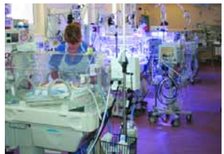
Of the unit's 31 cots, nine are intensive care.