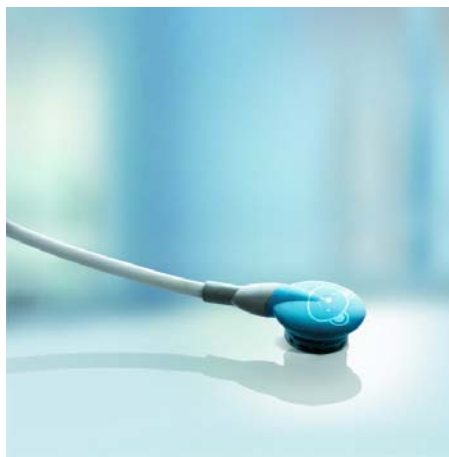
FIGURE 2 The 'Tiny Teddy' transcutaneous monitoring sensor.

Unfortunately, this move away from transcutaneous monitoring has left many NICUs without reliable continuous monitoring of p\text{CO}_2 . This is especially of concern where HFOV is used.