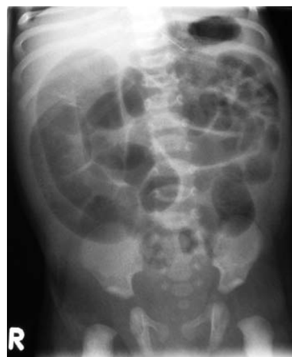
FIGURE 1 Abdominal radiograph demonstrating dilated loops of bowel with no evidence of pneumoperitoneum.

Intraoperative findings were of a necrotic disintegrated appendix with no macroscopically identifiable appendix